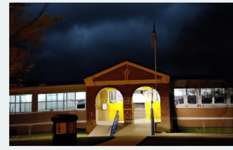
"It was a dark and stormy night at the middle school..."